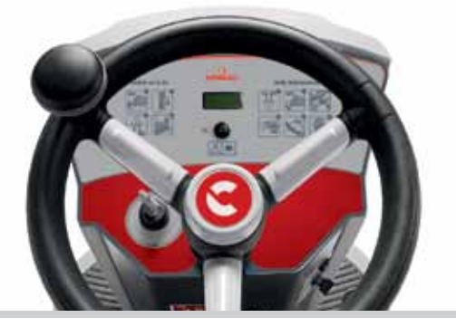
Just turn the key to start working immediately