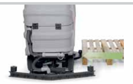
Automatic swing-in of the brush head when accidentally impacted (Innova 65/75/85/100 B / M)