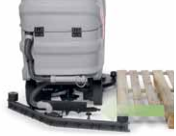
Automatic squeegee uncoupling when accidentally impacted