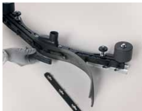
Easy rubber replacement without any tools on the exclusive Comac squeegee (Patent Pending)