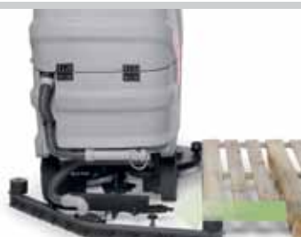
Automatic squeegee uncoupling when accidentally impacted