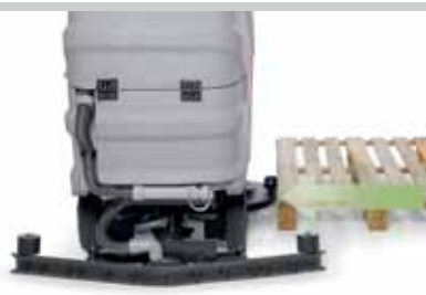
Automatic swing-in of the brush head when accidentally impacted (Innova 65/75/85/100 B / M)