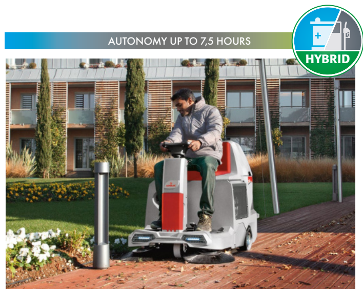
CS60 Hybrid operates up to 7.5 hours non-stop. While the sweeper is powered by the gasoline motor, batteries are recharged, in this way, you can switch from gasoline to battery supply to work in a silent, economic, and ecologic way