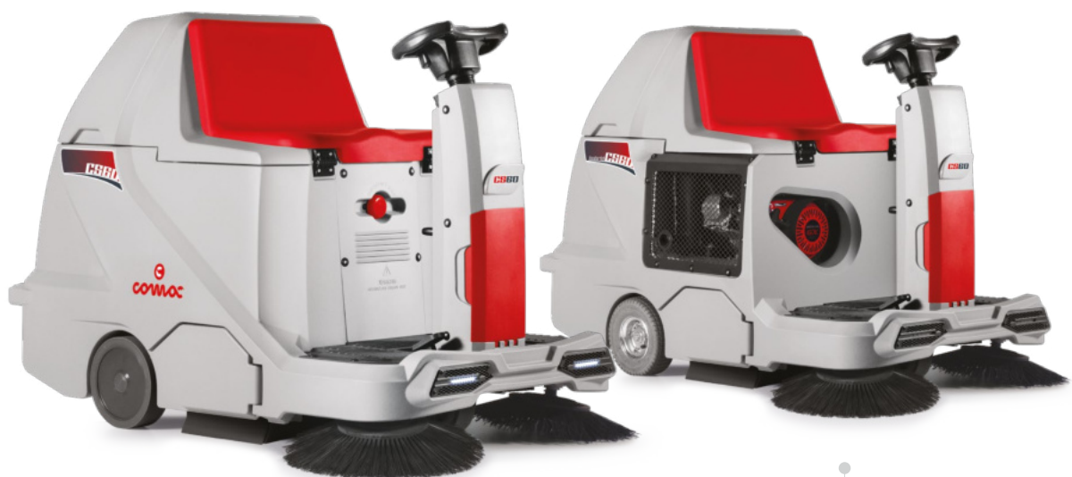
CS60 B Battery version