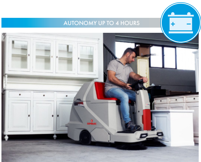
CS60 B is particularly recommended for working in indoor environments, also carpet floors as in hotels and convention centers.