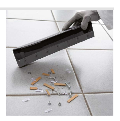
Vispa 35 BS Easy cleaning of the debris hopper