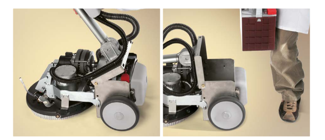
Vispa 35 B - Bs The battery compartment is easily accessible for quick battery replacement

Furthermore, excellent run time is also ensured by tank capacity. The mains-powered version is ideal for cleaning small areas without too many obstacles and it provides endless run time thanks to the cable.