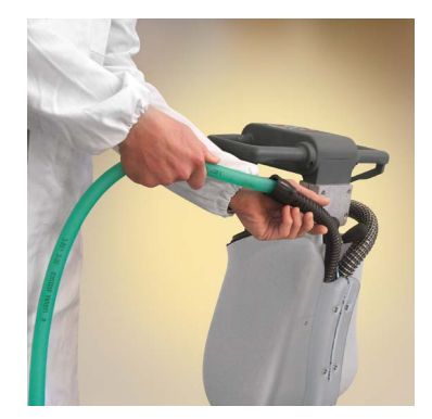
Vispa 35 B-BS Periodic cleaning of the squeegee hose to ensure efficient suction