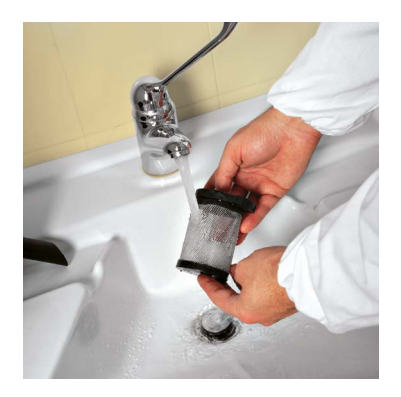
Vispa 35 E-B-BS Simple and practical thorough cleaning of the suction filter

Thanks to quick cleaning procedures at the end of the day, perfect machine efficiency is ensured over time.