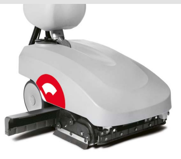
Vispa 35 BS The hopper is really easy to pull out to empty all the small debris that have been collected