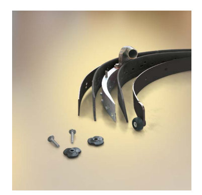
Vispa 35 E-B-Bs In order to ensure excellent drying performance, the squeegee rubbers should be kept always clean. When worn out, they are very easy to replace