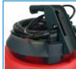
Ergonomic handle and cable strain relief