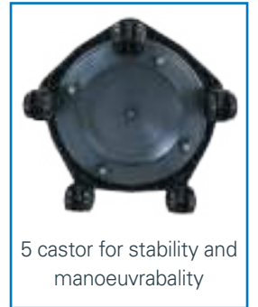
5 castor for stability and manoeuvrability