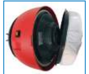
Motor head with filter basket complete