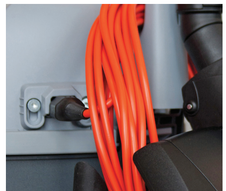
Detachable orange cord (VP300 HEPA)