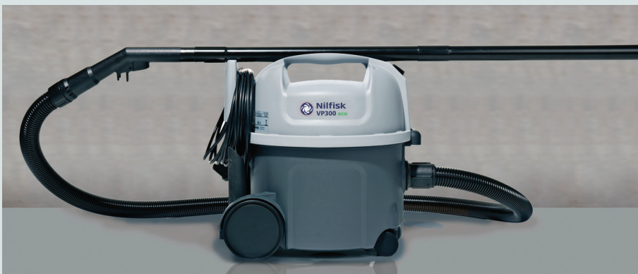
VP300 can be carried safely and comfortably in one hand