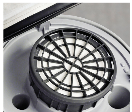
Higher filtration level with HEPA filter (VP300 HEPA)