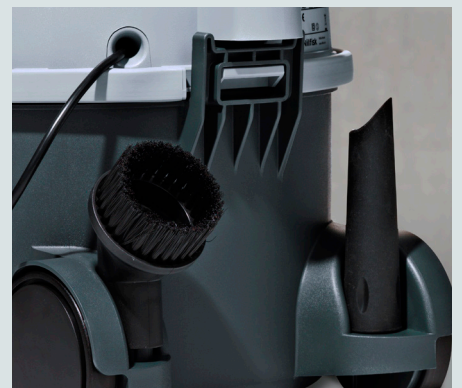
Discreet storage for nozzles allow all the tools you need to be within easy reach at all times